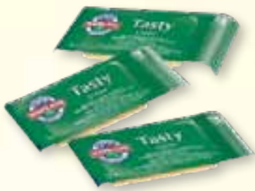
Mainland Tasty 21g

Contact your local Fonterra Sales Representative or visit www.fonterrafoodservices.com.au to find out more about the complete range of portion size products.