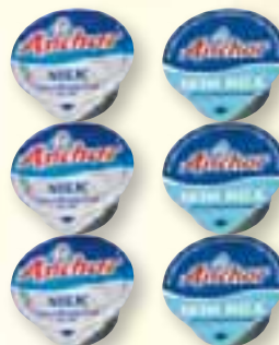
Anchor Milk and Skim Milk 15mL