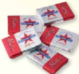
Western Star Portions 7g