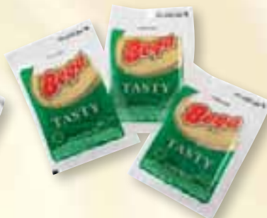
Bega Tasty 20g