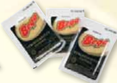
Bega Strong & Bitey 20g