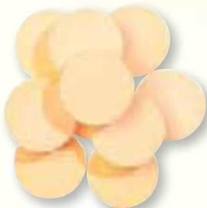
Western Star Medallions 8g