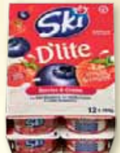
Ski D'Lite Berries and Crème Combo 100g